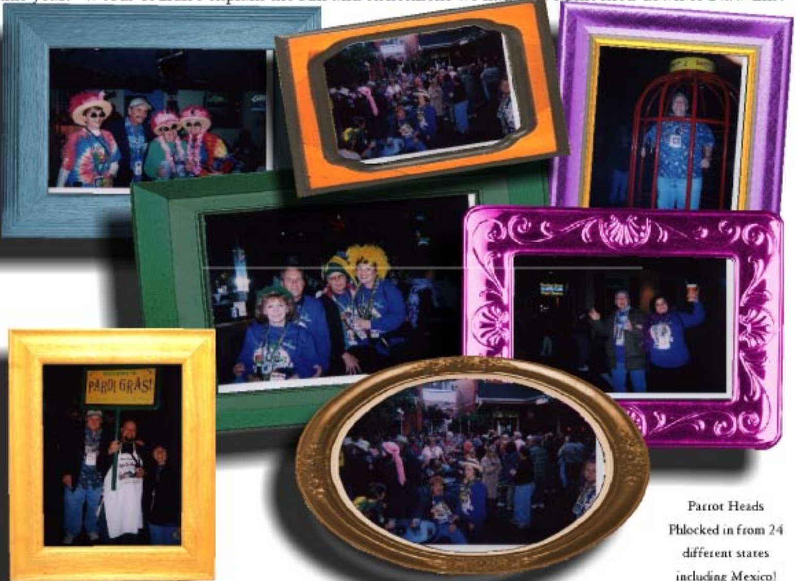
Parrot Heads Phlocked in from 24 different states including Mexico!

What a time we had! From awesome live bands, wonderful food, and great shopping, to a pub crawl down Bourbon Street! What more could you ask for! You have got to join us next year if you missed out this year. Words couldn't explain the fun and excitement we had as we phlocked down to Naw-lins!